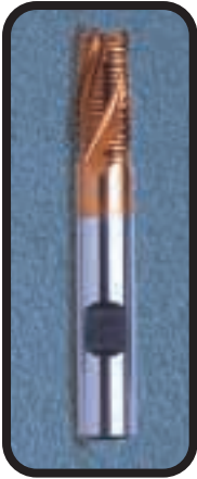
Product no. 803 658 1 SEMI-FINISHING END MILL High-cut coated

Product no's. 803 658 1 803 635 1 803 639 1