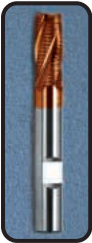
Product no. 803 635 1 ROUGHING END MILL High-cut coated